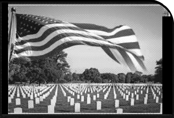
"The United States flag does not fly because the wind moves past it... The United States flag flies from the last breath of each military member who has died protecting it."

For your comfort remember to bring a lawn chair.